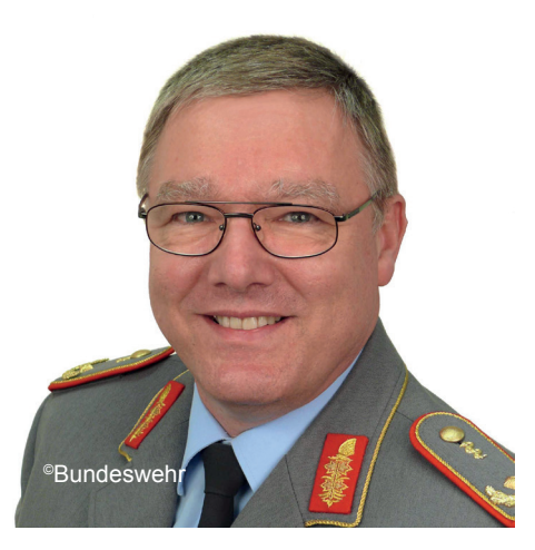
Director: Brigadier, (Medical Corps) Dr. Stefan Kowitz

The Ebola crisis has shown that the interdependencies between public health protection and external and internal security are increasing. One of the main goals of the MMCC-E is civil-military interaction and interface, especially with the organizations and institutions of the EU states and bodies.